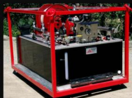
FIRE PUMPER POD