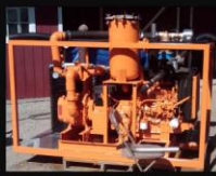
OIL SUPERSUKER POD