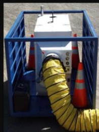
TD100 HEATER POD